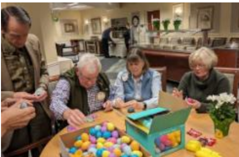
Some Egg Fillers