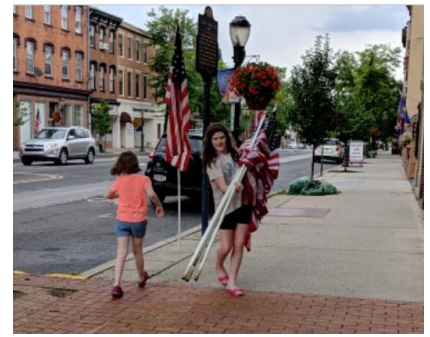
July 4, 2019 Flag Retirement