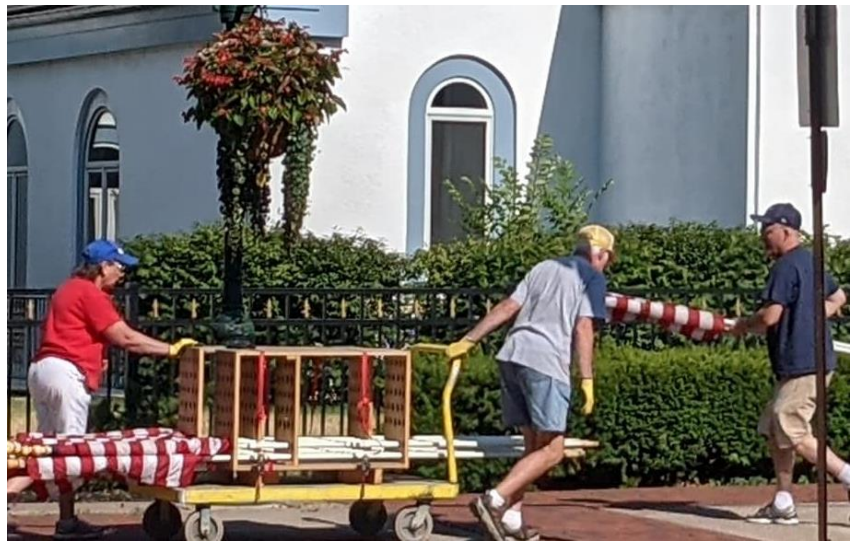
Fourth of July 2021 Flag Recovery