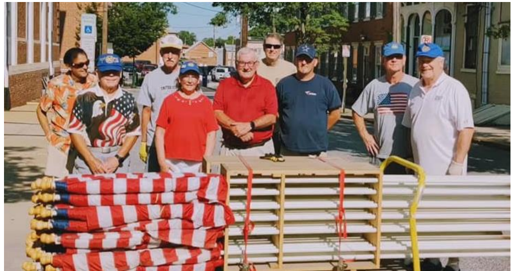
Flag Recovery Crew on July 4, 2021