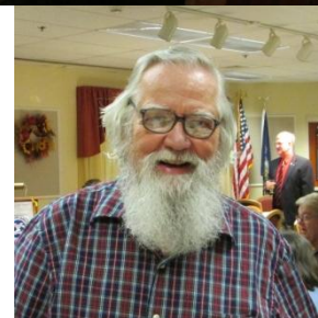
Top photo: Audience listening to our ONUG speaker.