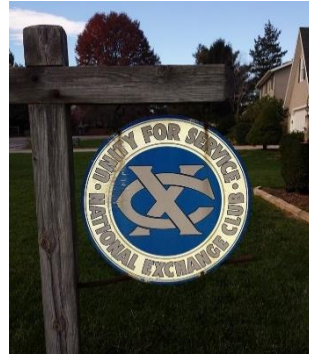
Old 18 inch sign