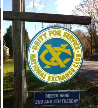
New 30 inch sign