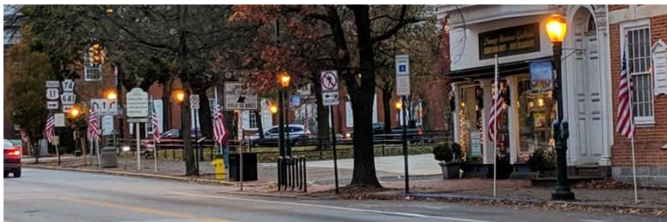
Flags on the Square on Veteran's Day 2019