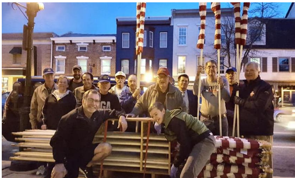
Retiring the Flags on the Square on Veteran's Day