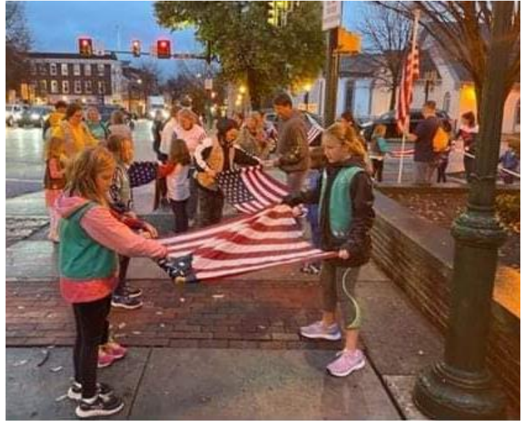
Scouts carefully rolling the flags for storage