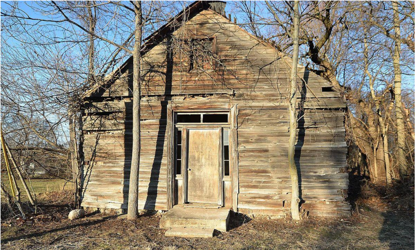
The Mount Tabor Church in Mount Holly Springs

The following link is for an article by Joseph Cress that appeared in the Sentinel about the Mount Tabor Church http://cumberlink.com/news/local/mount-tabor-church-in-holly-is-now-listed-on-county/article_18754c1c-5c53-53bc-bb64-538e4f5e4ae7.html .