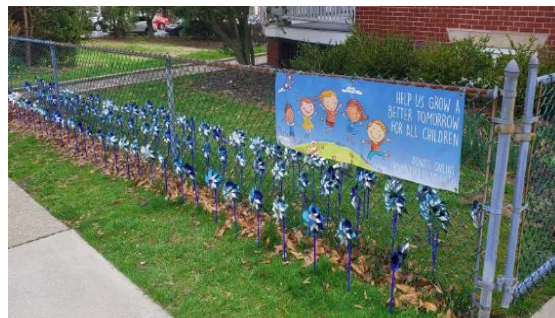
Sample of our type of garden