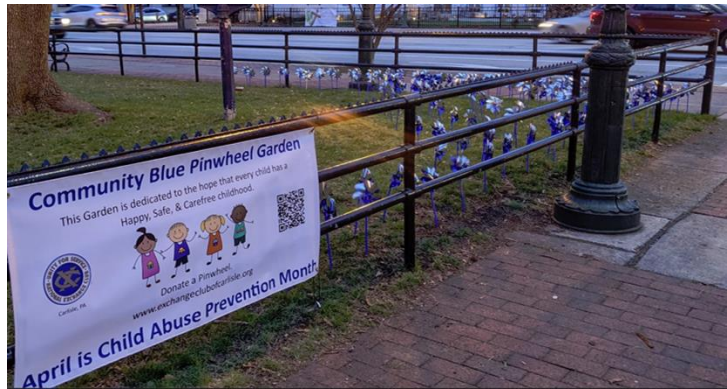
One of our 2023 Blue Pinwheel Gardens