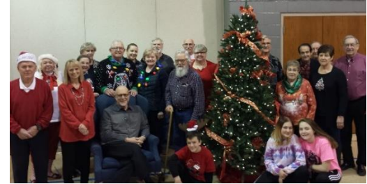
Santa's helpers that made it happen

The 50 families of the children who attended the Summer Program for Youth (SPY) Camp 2018 were invited. SPY is a long-established early intervention 8-week summer program for selected 'at-risk' rising 2 nd & 3 rd graders which focuses on improving their math and reading skills to ensure the children do not fall behind on their academics over the summer. This was the first year we had a 100% attendance of registered guests, plus we were able to accommodate an additional 5 children at the last minute for a total of 25 children of the total 73 people in attendance.