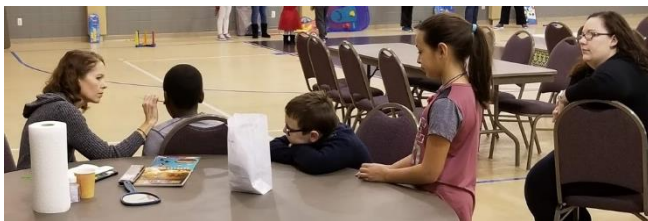
Elf Heather face-painting