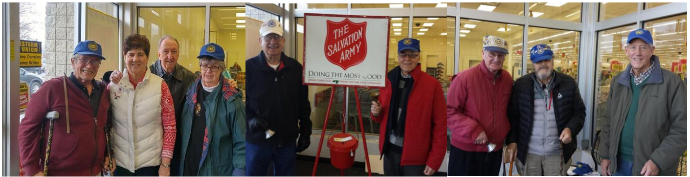
Dec 12 - Bell Ringing at Kmart