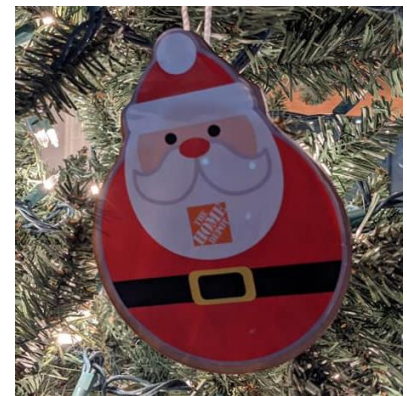
Home Depot DIY ornament