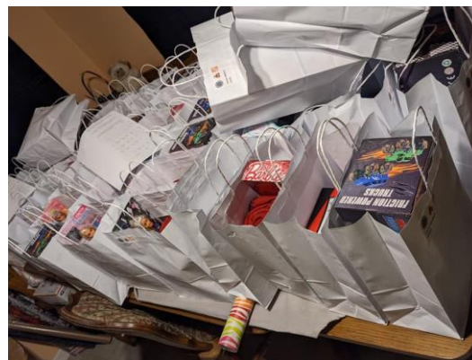
Gift bags before wrapping