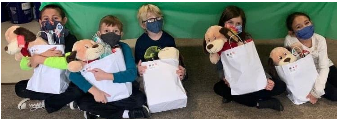
Some SPY Campers with their bags