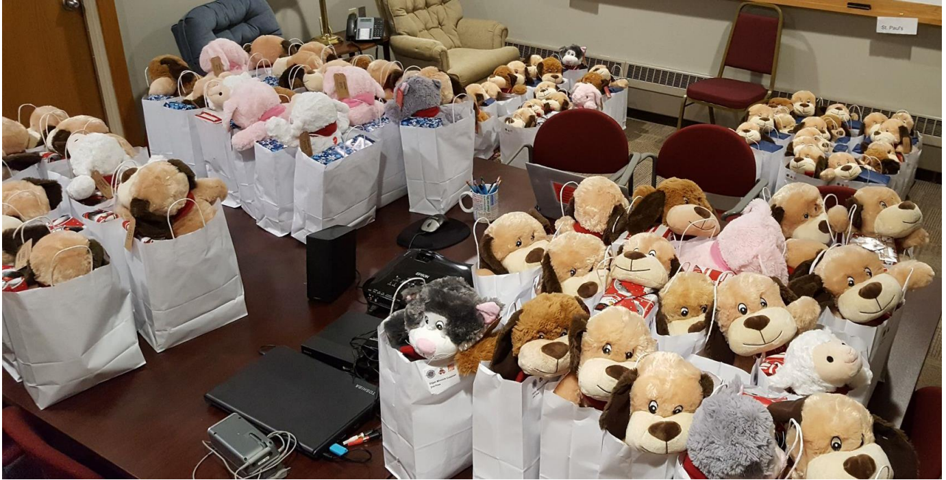
Gift bags ready for their new home