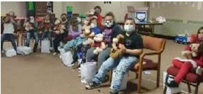
Some SPY Campers with their bags