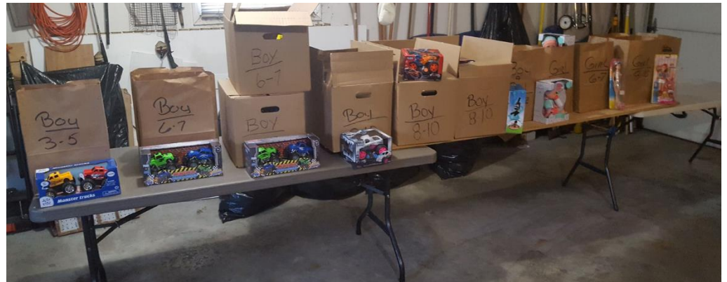
Boxes of toys from Carlisle Marine Toys for Tots Campaign