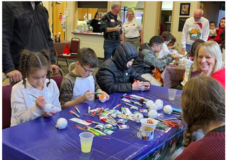
Plastic ornament decorating