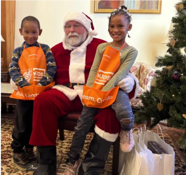
Santa took time with each child