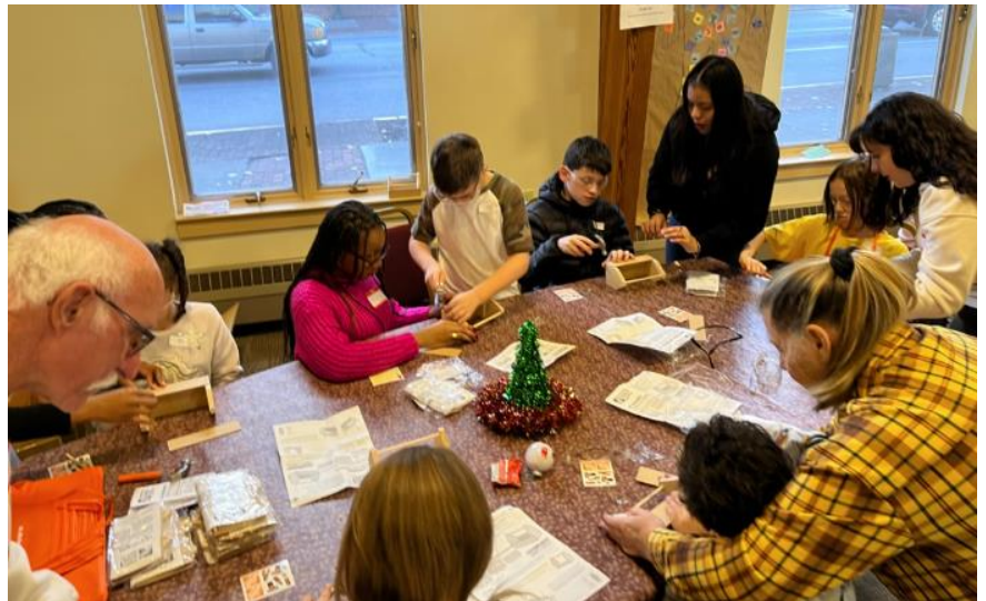
Home Depot wooden toolbox building