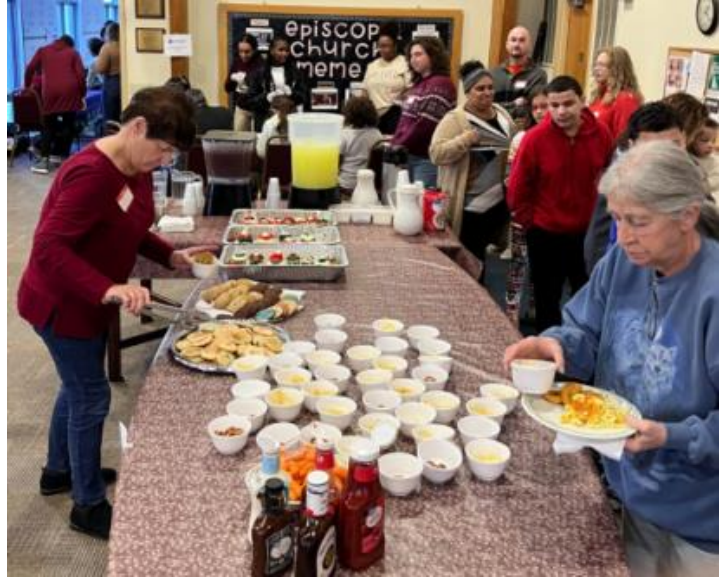
Meal was enjoyed by all