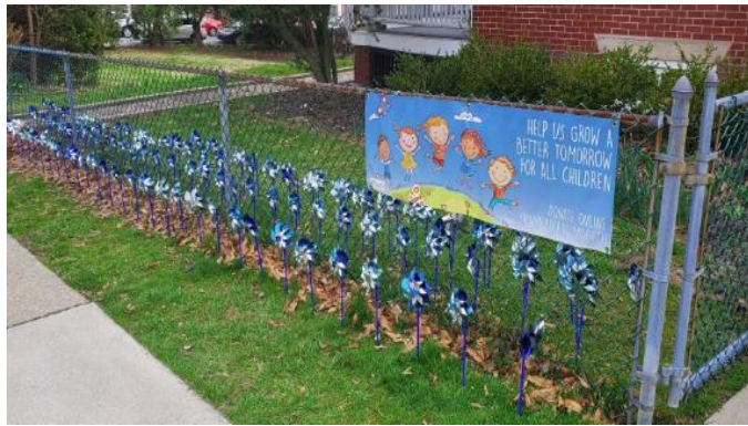
Sample of our type of garden