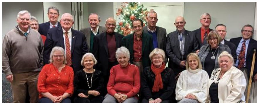
Members and guests at the Christmas party