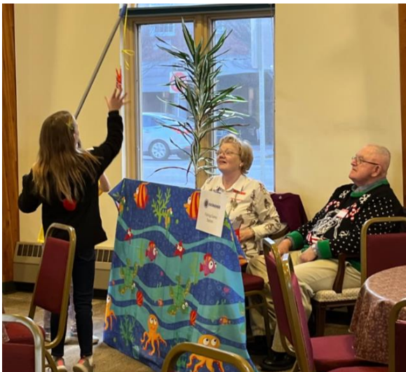
The Wood's Fishing Hole Game