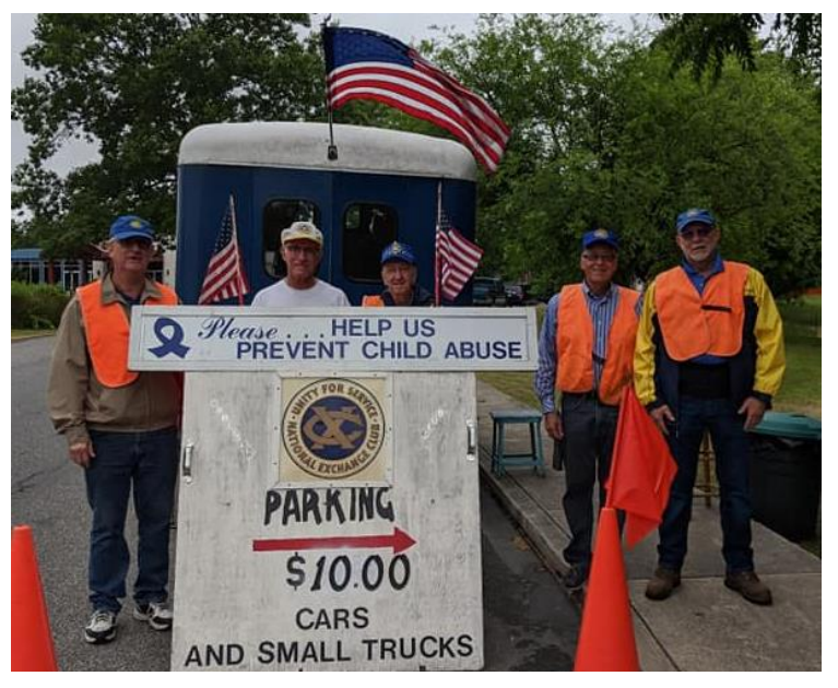
A shift ready to park cars.