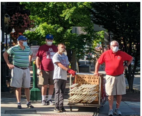
Waiting for the light to change