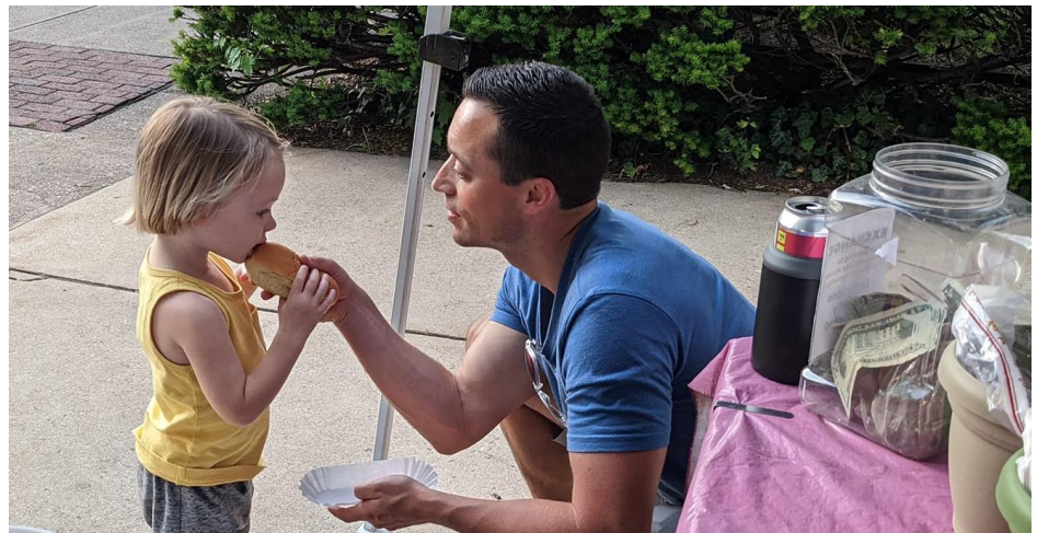
Young customer learning how to bite into a whole big boy style hotdog for first time

Cumberland Crossings is available for the club to hold their meetings. Starting in September, the meetings will be held there on the second and fourth Tuesday evenings. The social time will begin at 5:30, the speaker at 6:00, the dinner at 6:30 and the short business meeting will be at 7:00. The meal will be available for $20.