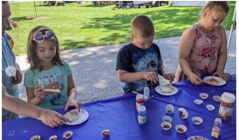
Kids decorating cookies with lots of sprinkles