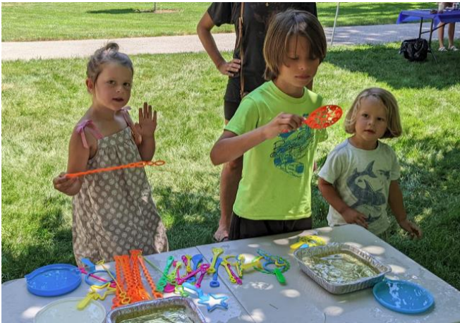
Kids at a bubble station