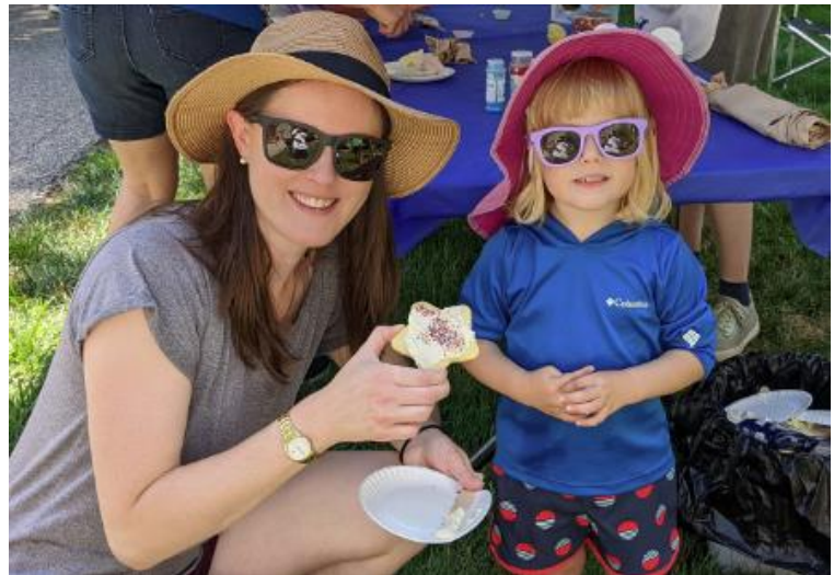
Kids at the Club's Summerfair children's activity stations doing bubbles and decorating cookies