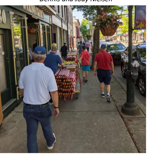
Stacked flags on way to storage