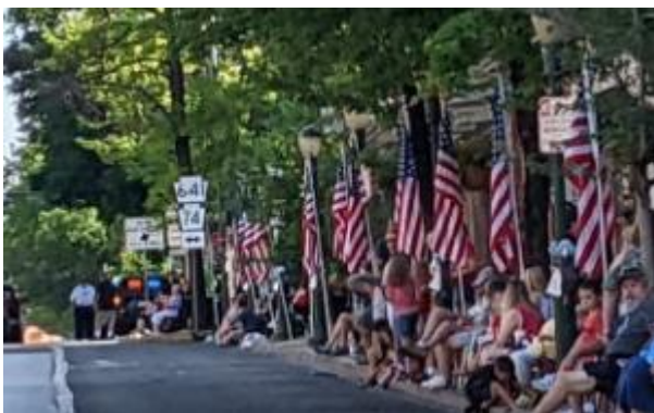
Some Flags lining the streets