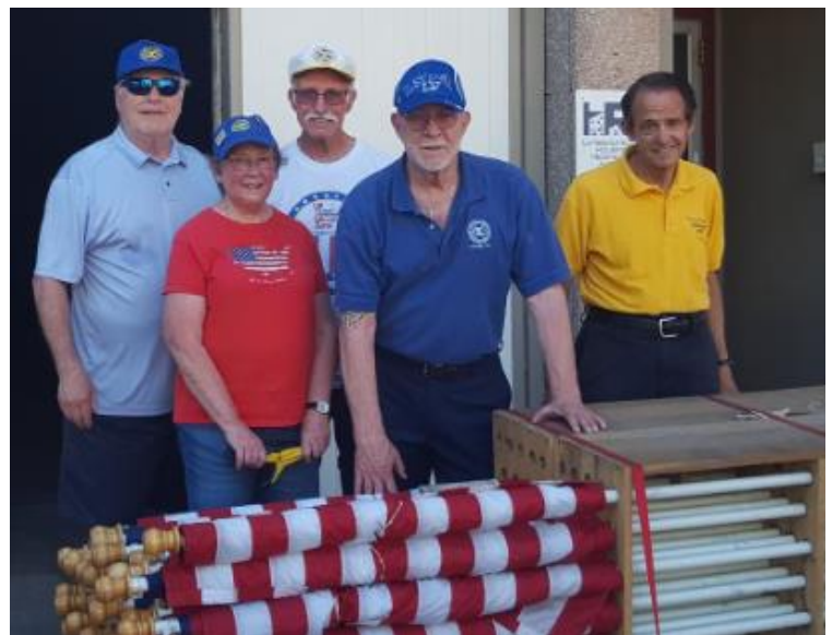
The flag retrieval crew