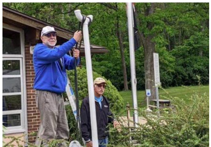
Coffee Break pictures