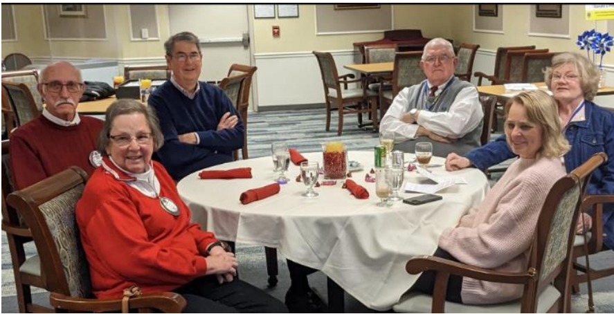
The Trivia Winners of Table 1.