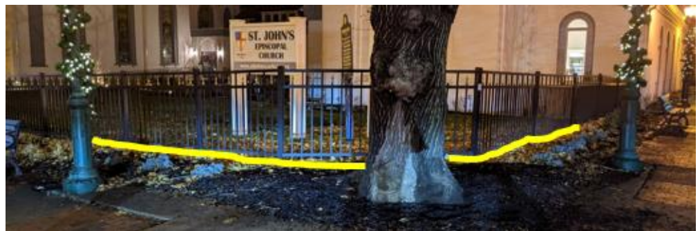
St. John's Episcopal Church fence-line area for Blue Pinwheel Garden