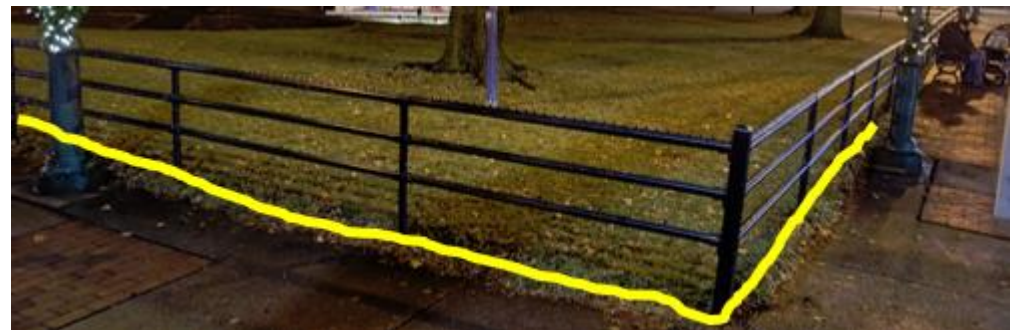
First Presbyterian Church fence-line area for Blue Pinwheel Garden