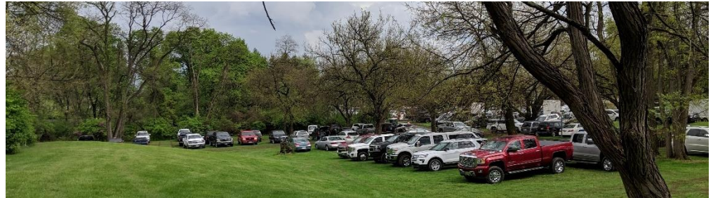
The Car Parking lot was beginning to fill up on April 26.