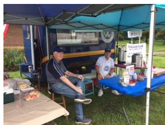
Labor Day 2018 Coffee Break

Our next service project and fundraiser is coming up on May 24 - 27, 2019. We will be providing free coffee, lemonade, hot dogs and muffins to weary travelers at the I-81 Southbound rest stop just south of Carlisle, PA. Since many elect to provide us a generous donation, this will help raise some money to help our programs. Please help if you are available.