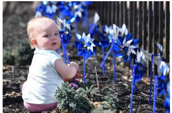
A 14-month-old girl loved picking more than planting the pinwheels