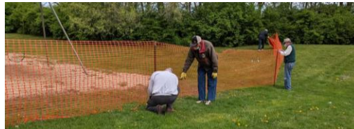
Safety Fence being installed