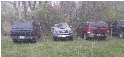
Snowing at Spring Carlisle Show