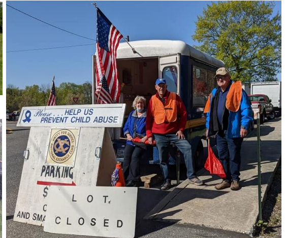
Workers at the full lot