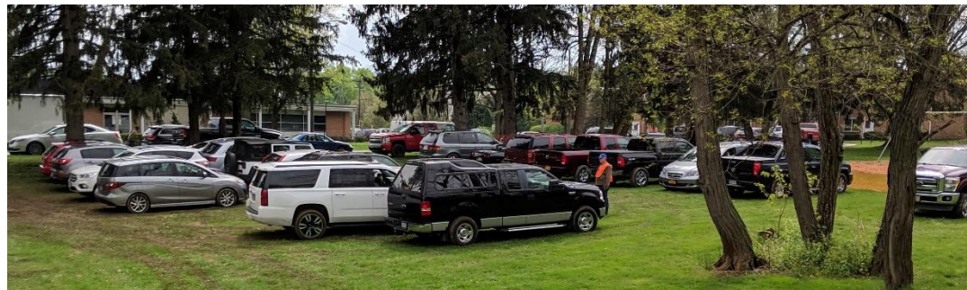
Cars parked on the grass.

Please come to our next meeting to personally welcome our newest member.