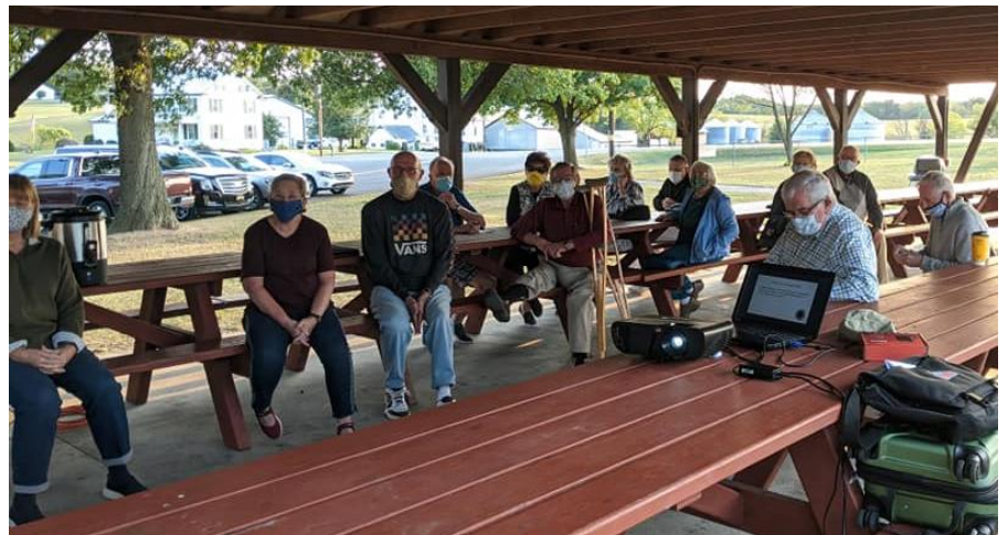
A meeting in a park