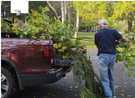
Bill Yufer removing cut branches