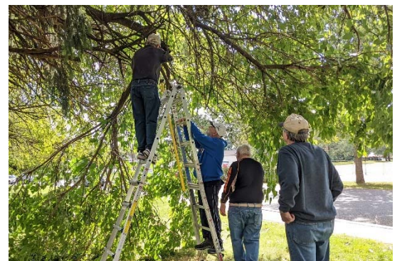
Tree crew trimming the branches to protect vehicles.