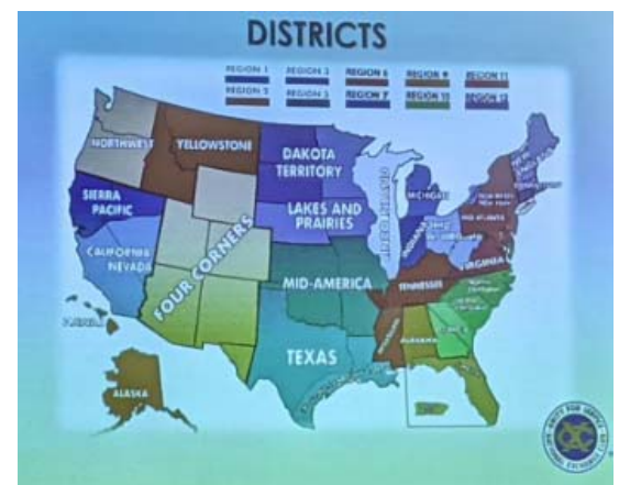
All the District locations