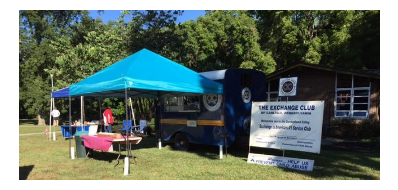
Labor Day Weekend Coffee Break—"Net $2,373.21 versus $2,452.53 last Labor Day." Treasurer Bob Beard