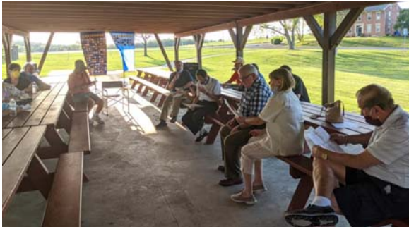
Outdoor Meeting, September 8 th

The Exchange Club of Carlisle has resumed meetings for the first time since February 2020. It was determined that an outdoor location would better suit club members. So on September 8, 2020, the club held a meeting outdoors at a North Middleton Park Pavilion from 6:00 pm - 7:00 pm with 22 people in attendance and on September 22, 2020 the club held a meeting at the same time and location with 15 people in attendance.