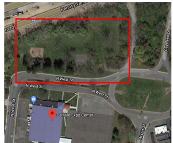
Housing Authority Playground Area.