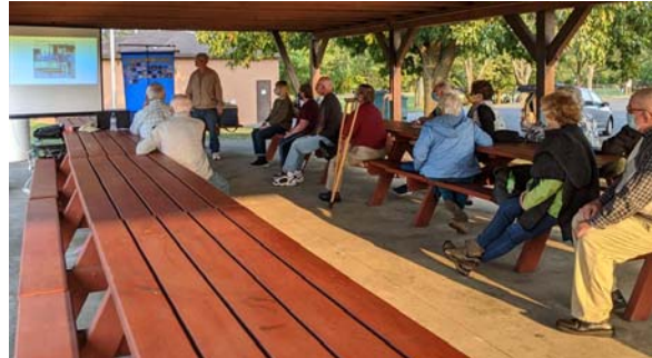
Outdoor Meeting, September 22 nd