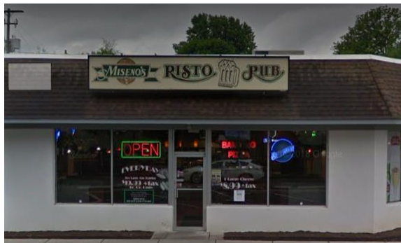
Miseno's II Ristro Pub - 598 W. High St. Carlisle, PA

An important change to the meeting is that members are to order their drinks and a meal if desired on their way into the meeting. We will be in the private room on the right side of the building. After the 6:00 speaker, the meals will be served about 6:30 prior to the short business meeting. The menu is attach to this newsletter.