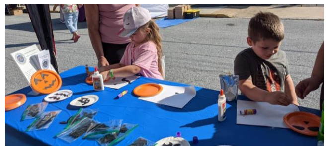
Kids making jack o'lantern faces at the Holly Festival Day