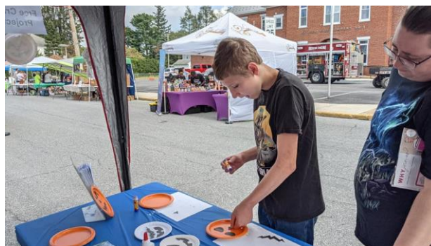
Holly Festival Days Pictures