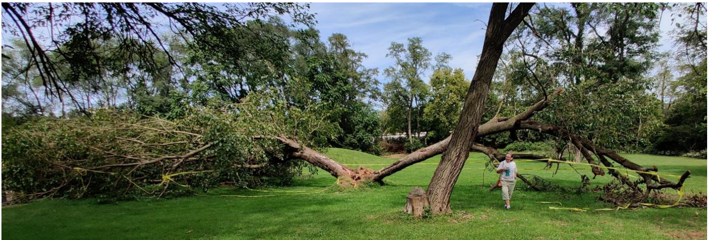
Jean Yufer is examining the tree that fell in our car parking area just before our set-up.