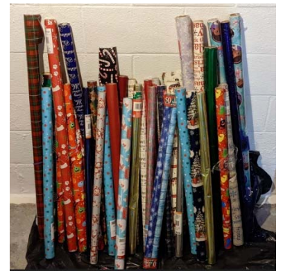
Collected wrapping paper

In preparation for the Children's Christmas party, a request was sent out for donations of Christmas wrapping paper for the Children's gifts. Members donated the wrapping paper they have had laying around their homes. The huge pile of wrapping paper will be enough to cover all the gifts this year.