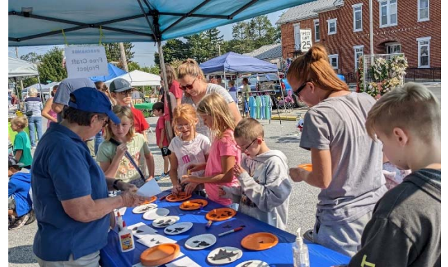
Kids making Jack-o-lanterns at the club's craft station