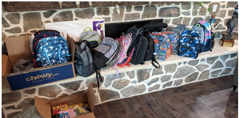
28 Backpacks and School Supplies for LeTort Elementary School