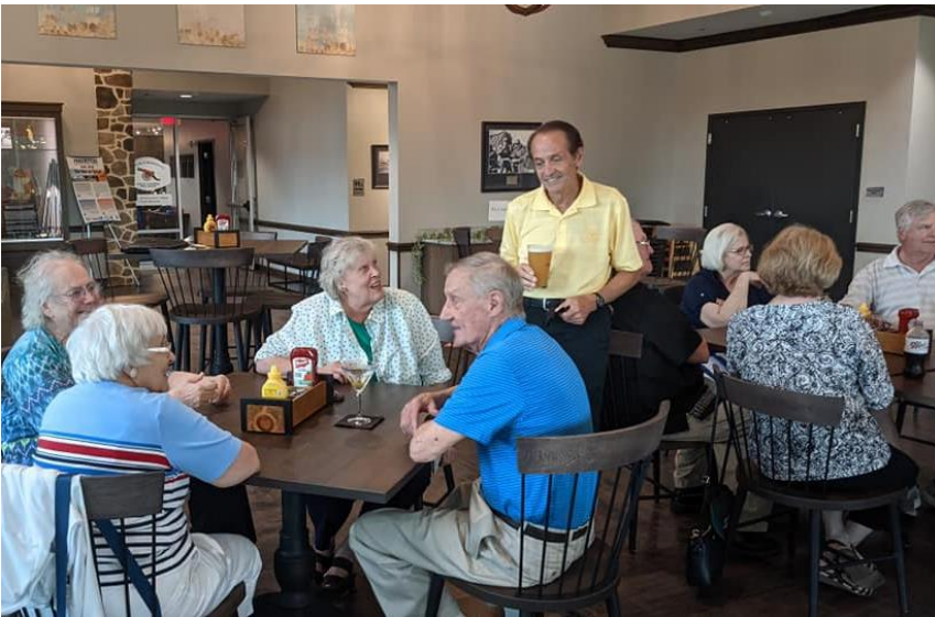
Social time before dinner.