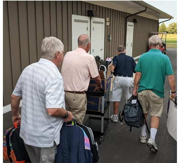
School supplies being transferred.