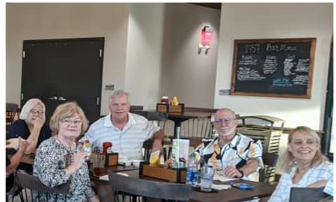
Guests enjoying the principal speaking.