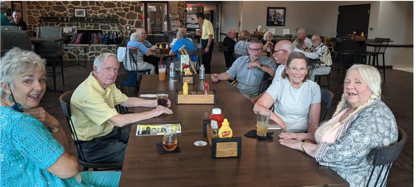
Social time before dinner.