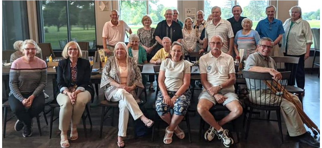
Club Member Summer Picnic