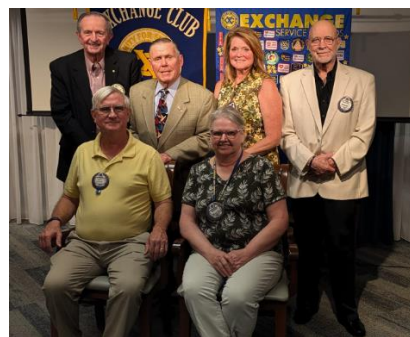
2024 - 2025 Board of Directors