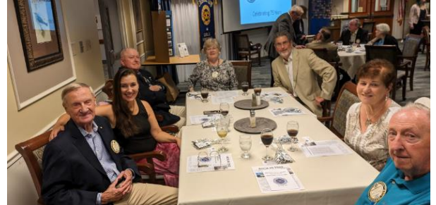
One of the tables at the dinner