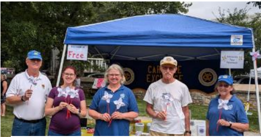
Pinwheel craft crew