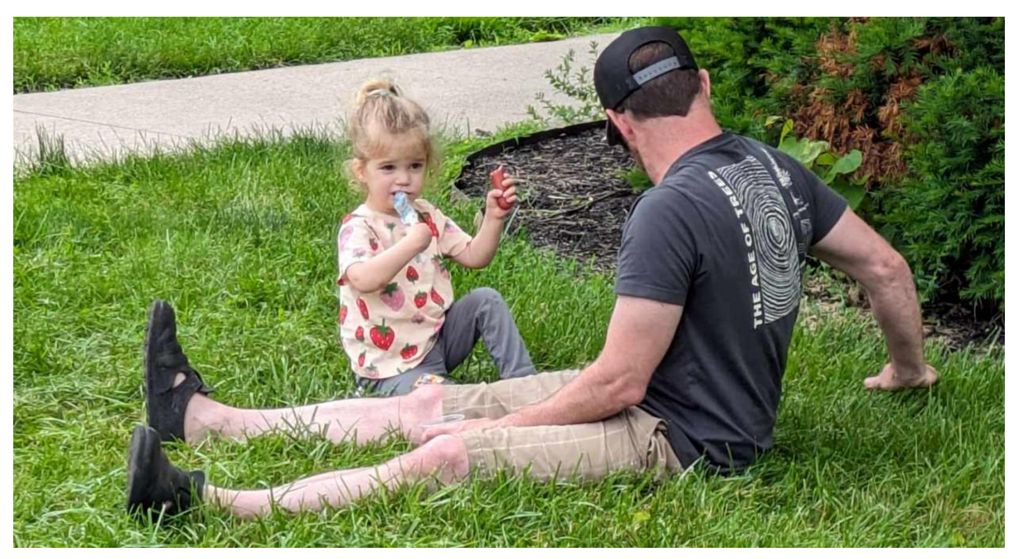
Little girl enjoying an ice pop and hot dog at the Coffee Safety Break