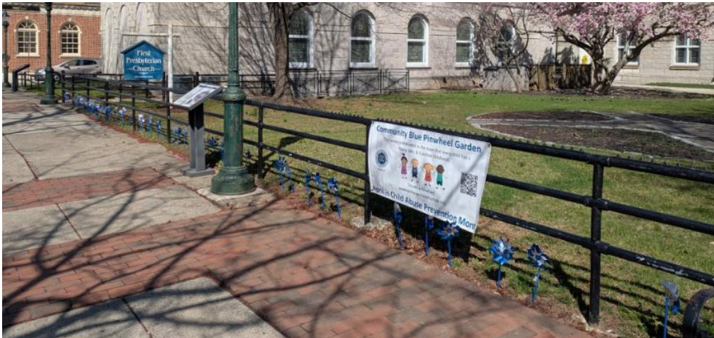
Pinwheel Garden in front of the First Presbyterian Church