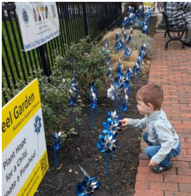
Little Boy planted a pinwheel during Bunny Hop