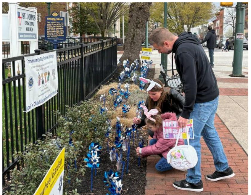
A family planted a pinwheel during the Bunny Hop