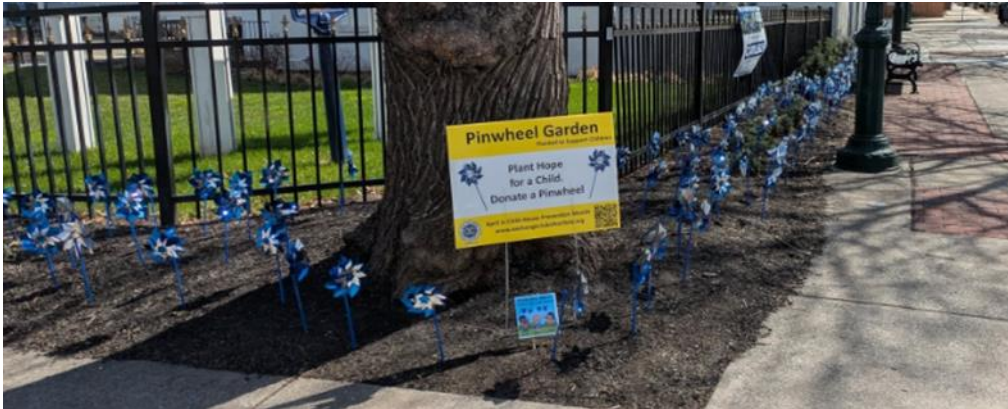
Pinwheel Garden in front of St. John's Episcopal Church