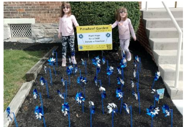
Kids working hard to plant pinwheels to help other kids