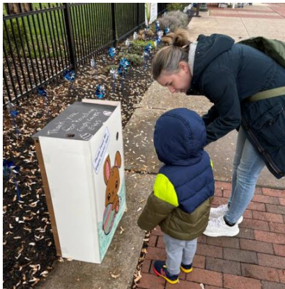
Child recycling Easter Eggs for next year