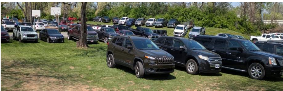
Some of the parked vehicles