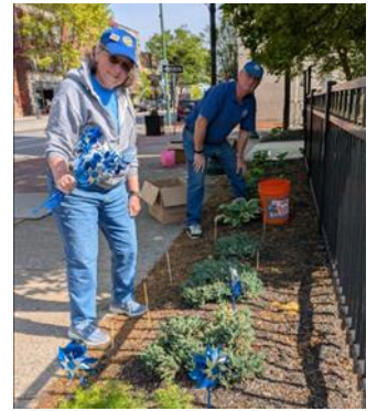
Pinwheels were removed on May 1, 2025 and packed away until 2026. Lots of bending and reaching!!!