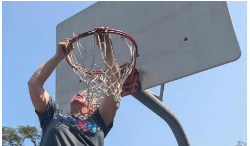
Fixing Basketball Nets