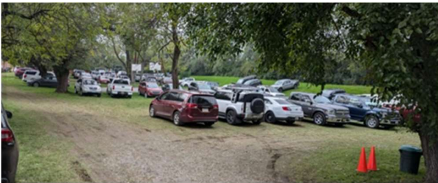
Some parked Cars